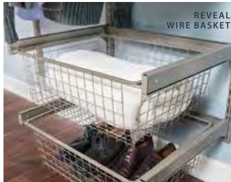
REVEAL WIRE BASKET