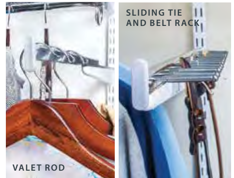
SLIDING TIE AND BELT RACK