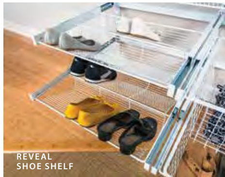
REVEAL SHOE SHELF