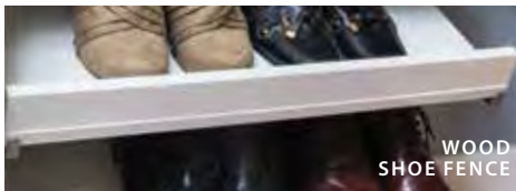
WOOD SHOE FENCE