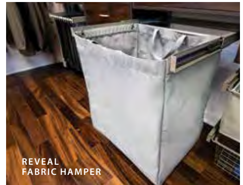
REVEAL FABRIC HAMPER