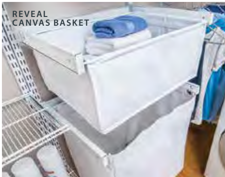
REVEAL CANVAS BASKET