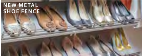
NEW METAL SHOE FENCE