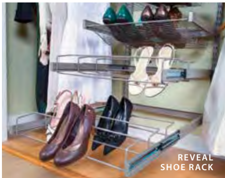
REVEAL SHOE RACK